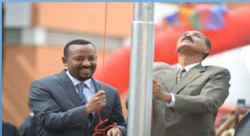
Ethiopia's Prime Minister Abiy Ahmed (left) and Eritrea's President Isaias Afwerki re-opening the Eritrean embassy in Addis Ababa.